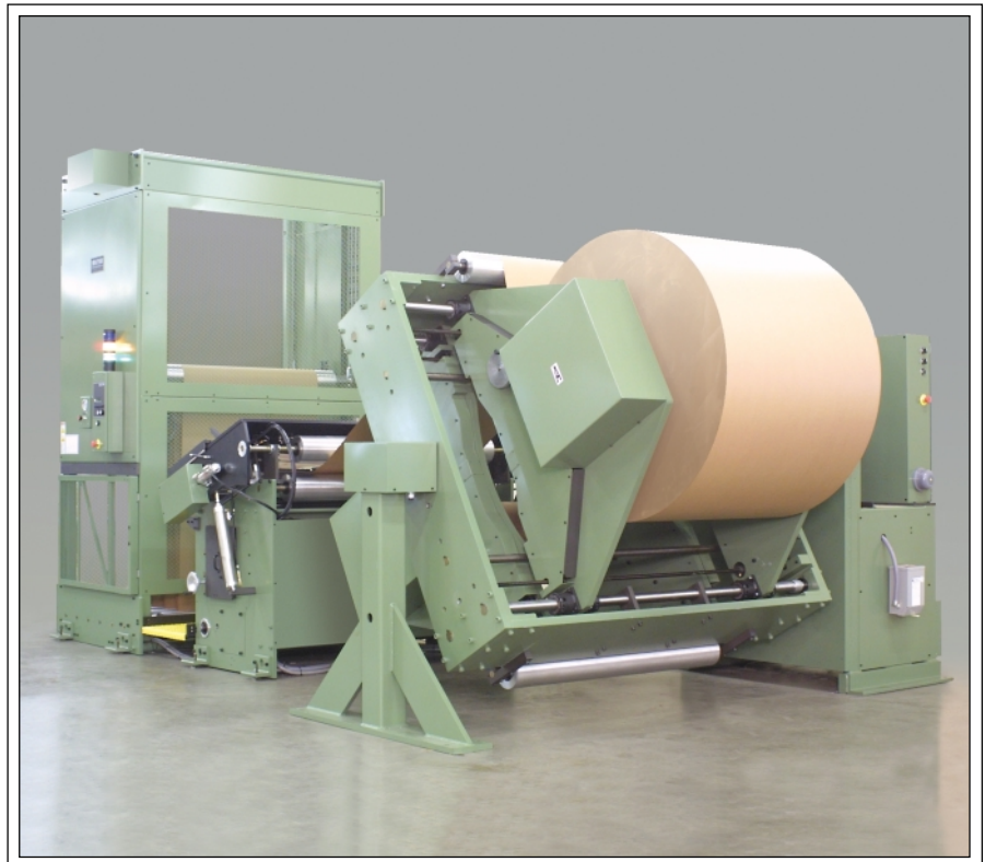
Shown: ZL 5072-05, Three Piece Butt Splicer for Light Board