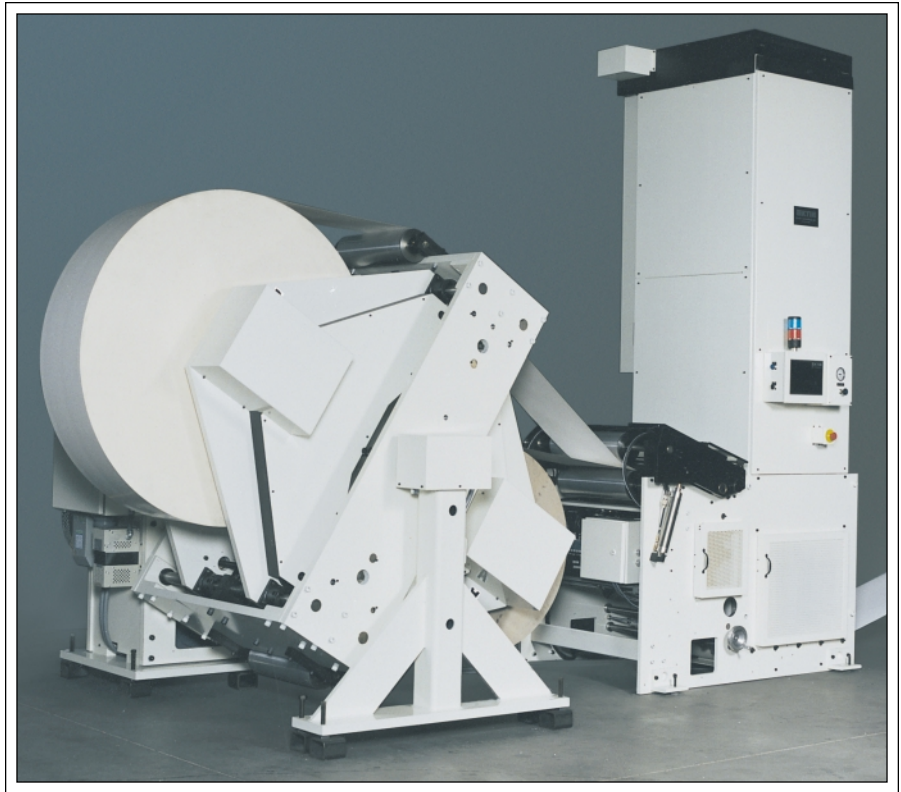
Shown: ZL 2272-05, Two Piece Butt Splicer for Light Board

14357 Commercial Parkway South Beloit, IL 61080 Phone: 815-624-8989 Fax: 815-624-4223 Internet: www.keenetechnology.com E-mail: info@keenetechnology.com