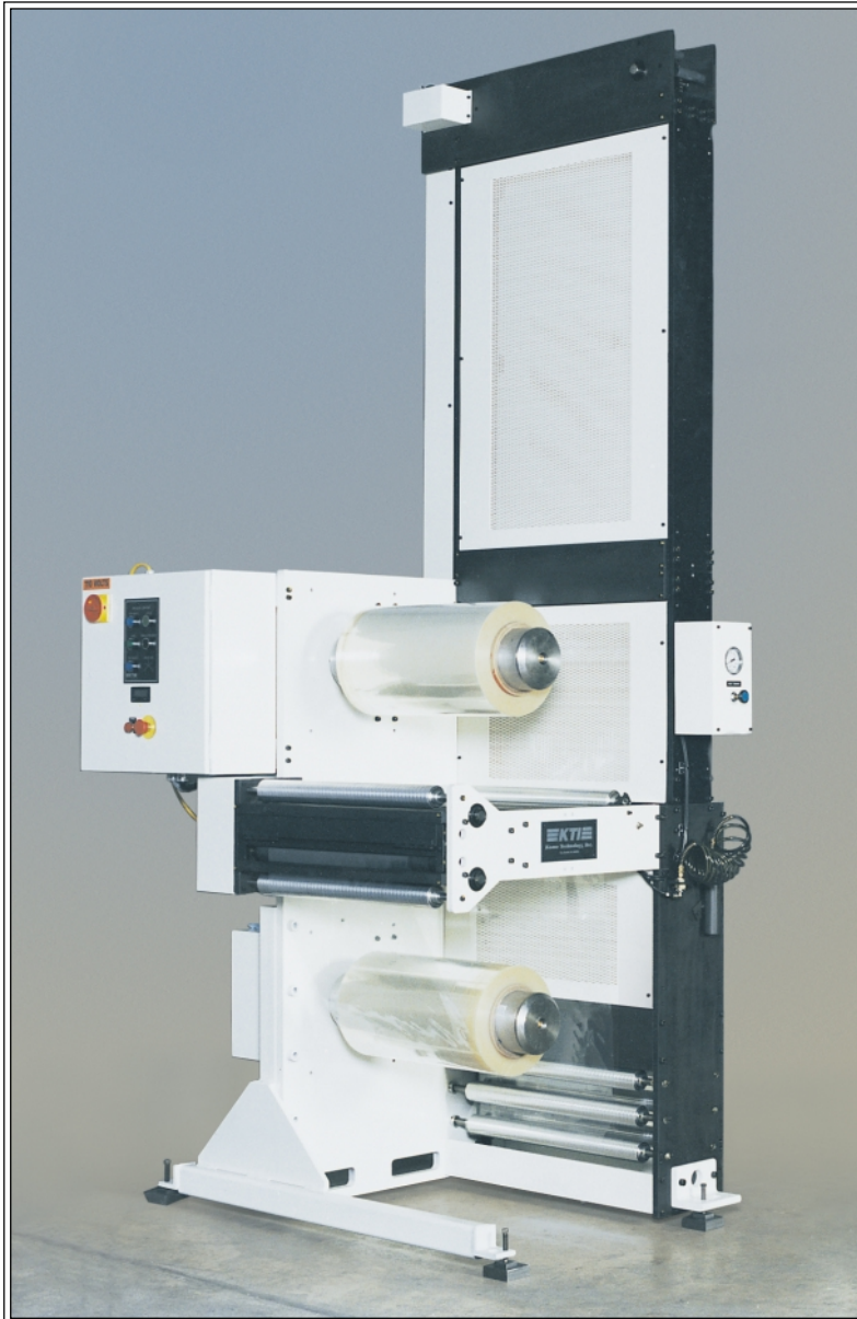
Shown: Model PA 2024-05 Packaging Splicer

14357 Commercial Parkway South Beloit, IL 61080 Phone: 815-624-8989 Fax: 815-624-4223 Internet: www.keenetechnology.com E-mail: info@keenetechnology.com