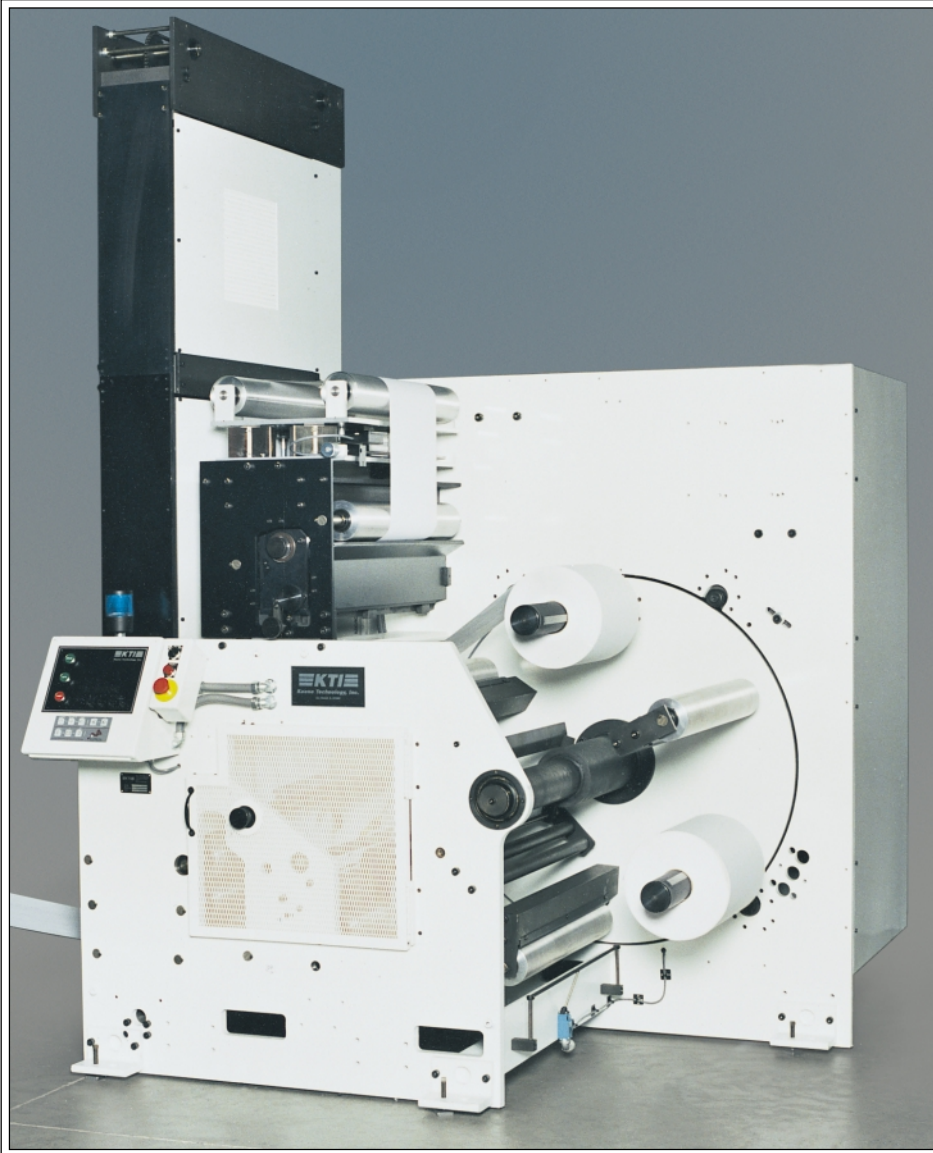
Shown: MR 2024-05, Turret Rewind

14357 Commercial Parkway South Beloit, IL 61080 Phone: 815-624-8989 Fax: 815-624-4223 Internet: www.keenotech.com E-mail: info@keenotech.com