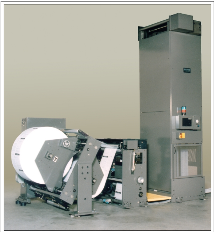
Shown: ZG 2640-10, Butt Splicer for Tag and Label