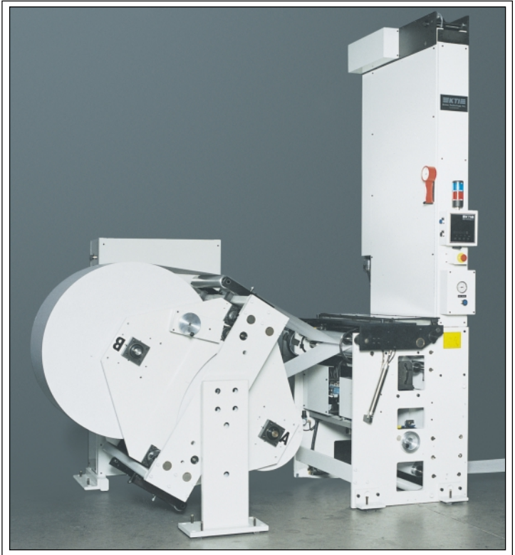
Shown: ZG 2040-05, Butt Splicer for Tag and Label

14357 Commercial Parkway South Beloit, IL 61080 Phone: 815-624-8989 Fax: 815-624-4223 Internet: www.keenetech.com E-mail: info@keenetech.com