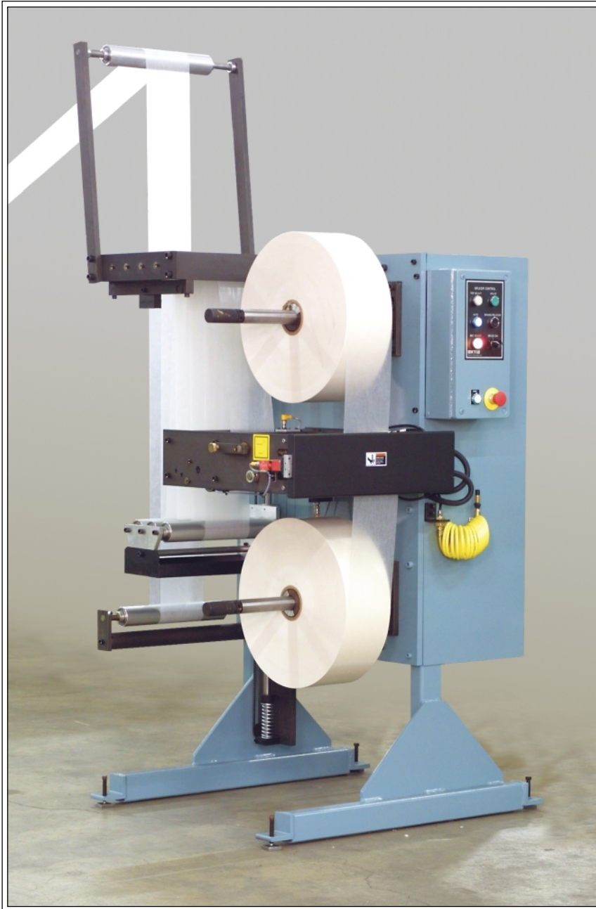
Shown: PS 1220-03, Window Film Splicer

14357 Commercial Parkway South Beloit, IL 61080 Phone: 815-624-8989 Fax: 815-624-4223 Internet: www.keenetech.com E-mail: info@keenetech.com